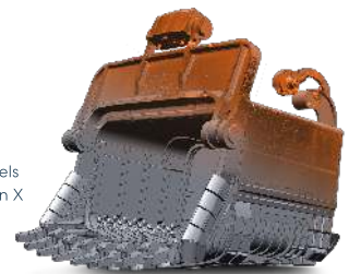
A parametric solid models created in Geomagic Design X

If you can design in CAD, you can start using Geomagic Design X right away. It's fully-renewed user interface and workflow tools make it easier than ever before to quickly and accurately create as-designed and as-built 3D CAD and model data.